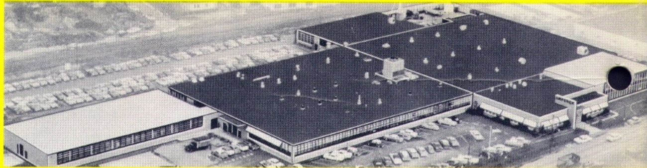
Ampere Electronic Corporation, Hicksville, Long Island, New York Sales Offices, Applications Laboratories and Tube Manufacturing Plant