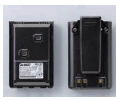
● Li-ion Battery (EBP-87) DC 7.4V 1500mAh