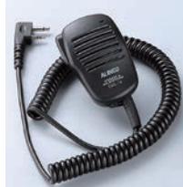
● Microphone (EMS-76)