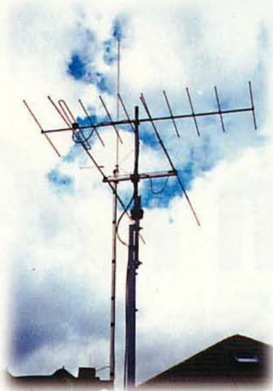
● The antennas used by GORSN when operating from G7VJJ's shack to evaluate the IC-910H transceiver.

We started off the QSO with G0AOZ receiving a 4 and 2 report. However, after raising the antenna to