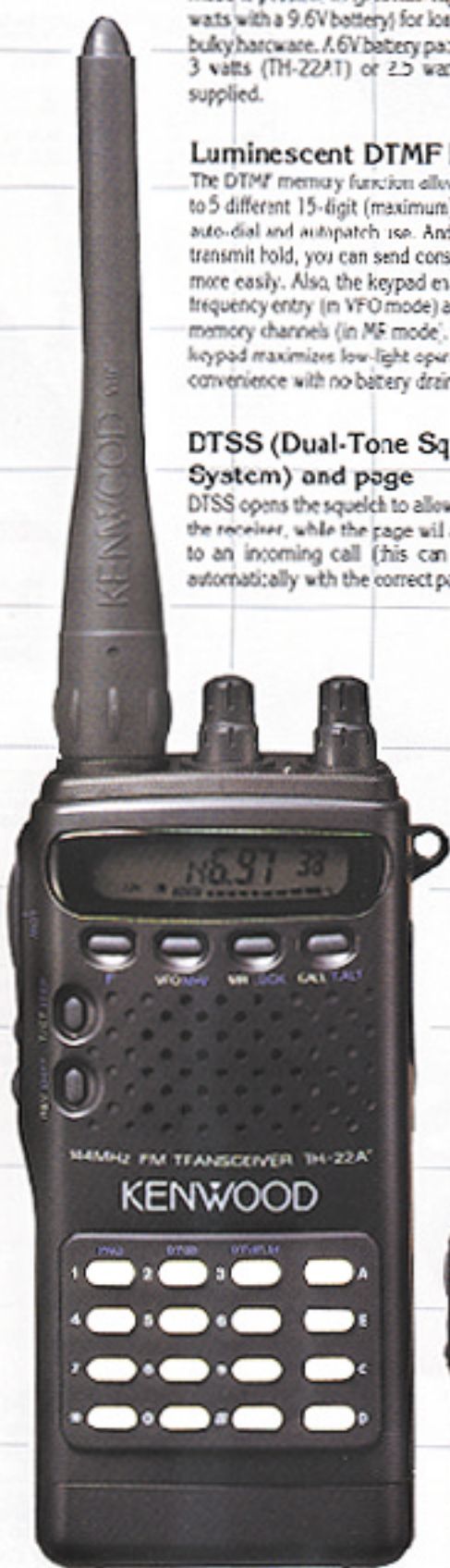
TH-22AT (actual size)