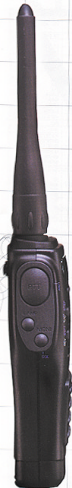
TH-22AT (side view)