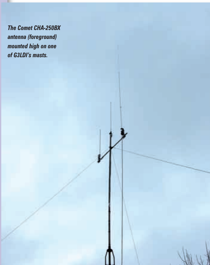
The Comet CHA-250BX antenna (foreground) mounted high on one of G3LDI's masts.

enormous with their accompanying radials and loading coils but the vertical I've been testing has only one matching section at the bottom and no radials at all and would be fairly inconspicuous. The only disadvantage of this particular vertical is that it must be mounted about 10m (35ft)* in the air. The antenna is 7.3m (24ft) long, so again it might be difficult to achieve this height. The frequency range is from 3.5 to 50MHz, however, so it's a genuine multi-band antenna. The vertical arrived in a small cardboard box and the complete contents can be seen in Fig. 1, as I laid them out on my lawn.