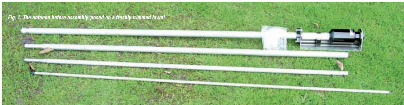
Fig. 1: The antenna before assembly, posed on a freshly trimmed lawn!

section has the 'magic' matching network built-in.