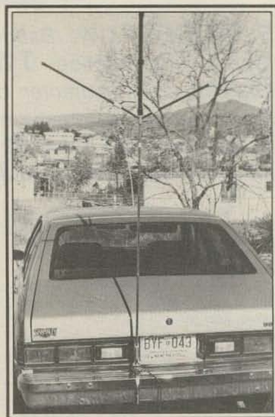
The Spider Antenna is shown in two installations. On the left it is mounted on the rear of the author's RV, and on the right it is bumper-mounted to his car.

band, 1.7 to 1 across 15, and 1.5 to 1 for 500 to 600 kHz on 10. On 40, the antenna was less than 2 to 1 across 100 kHz. In all cases we had a match of 1 to 1 at the desired frequency. However, the beauty of the antenna is that you can get out of the car and make a slight adjustment of the resonator sleeve to any premarked setting for a perfect 1 to 1 match. As mounted on our RV, the tuning was much sharper because of the proximity of the trailer body to the resonators. But again, it worked. We plan on mounting the antenna on the roof of the trailer when parked, and then we'll have the excellent ground of the trailer roof. It will be easy to mount the