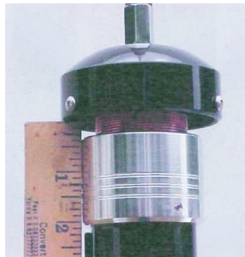
Model 75A "Stubby" -- 14.2 MHz with 5 ft. whip @ 1/2" of coil showing