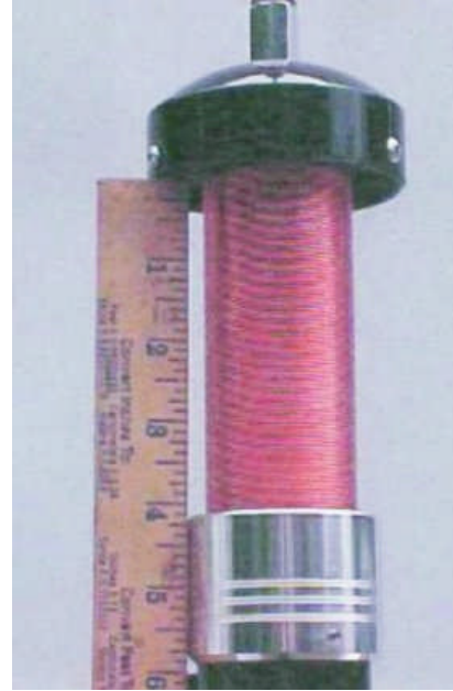
Model 75A "Stubby" -- 3.9 MHz with 5 ft. whip @ 4" of coil showing