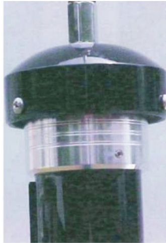
Model 75A "Stubby" -- full down position with 5 ft. whip -- 34.0 MHz