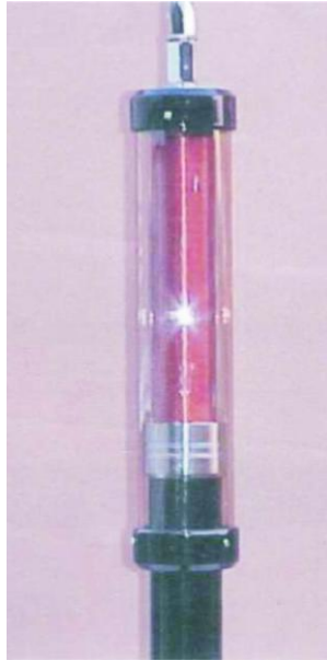
Little Tarheel II in 80 meter position with 32" whip