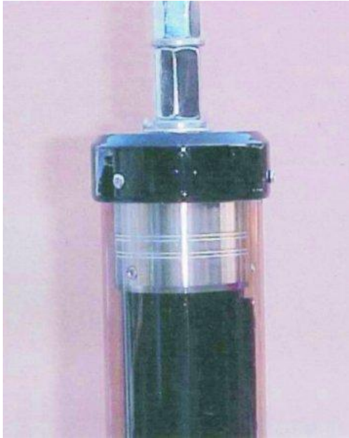
Little Tarheel II in 6 meter position with 32" whip

The following photos will show you relative tuning positions of the Little Tarheel II antenna.