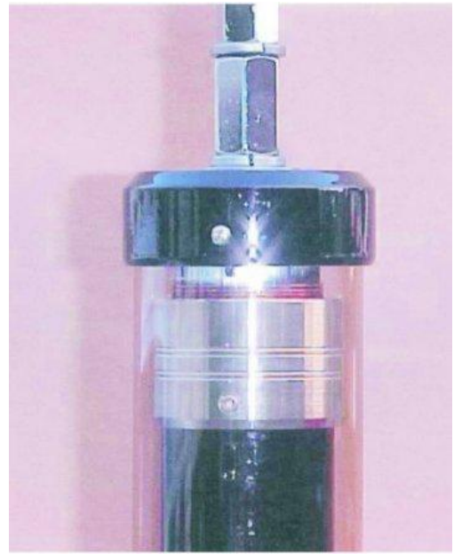
Little Tarheel II in 10 meter position with 32" whip