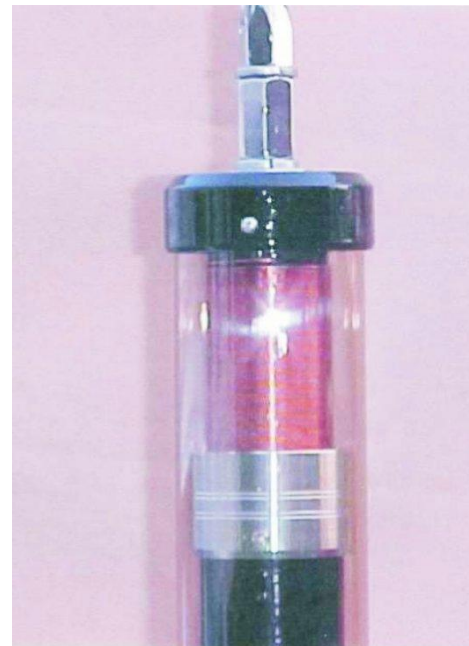
Little Tarheel II in 40 meter position with 32" whip