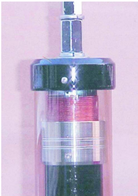
Little Tarheel II in 20 meter position with 32" whip