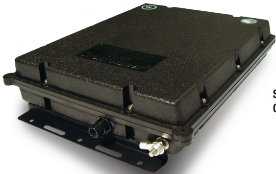
SG-230 Cat. # 54-14

The SG-230 Smartuner was the first product in the HF market to offer fast, flexible tuning without any user interface. This unit works with ANY radio and ANY antenna without any special interface, making it the most versatile tuning product available. The SG-230 can be used in base station, mobile, marine and aviation and has been the "Gold Standard" of automatic antenna tuning for nearly twenty years.