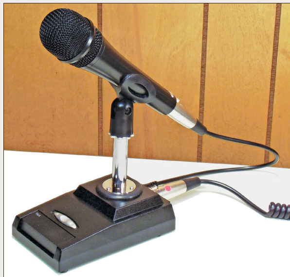
The INRAD M629 on the DMS-1 base.

I connected the DMS-1 to my K3 transceiver's front panel MIC jack, using both an INRAD M629 and another mic with a matching three-pin XLR connector. Both worked fine. The base is quite heavy, so the mic won't easily move around on the desk. Using the stand with a microphone without the three-pin XLR connector would just require terminating the mic's audio cable with a \frac{1}{8} -inch phone plug and screwing the mic onto the standard base threads. This is a great solution for those old mics that didn't come with PTT stands. Just note that tube-era high-impedance crystal mics, for example, don't play well with modern radios. Matching transformers and other solutions are available. This will be on my Christmas list! — Joel R. Hallas, W1ZR