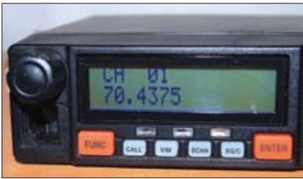
Fig. 1: The simple layout of the controls perhaps indicate the 'designed for PMR' influence.

However, with the information contained in the manual, which I would describe as 'indicative' rather than 'comprehensive', I managed to do everything that I wanted to do! Users should expect to have to fiddle around a bit and for the manual not to be as accurate as you might have wished – but keep a sense of humour about you and you'll be fine!