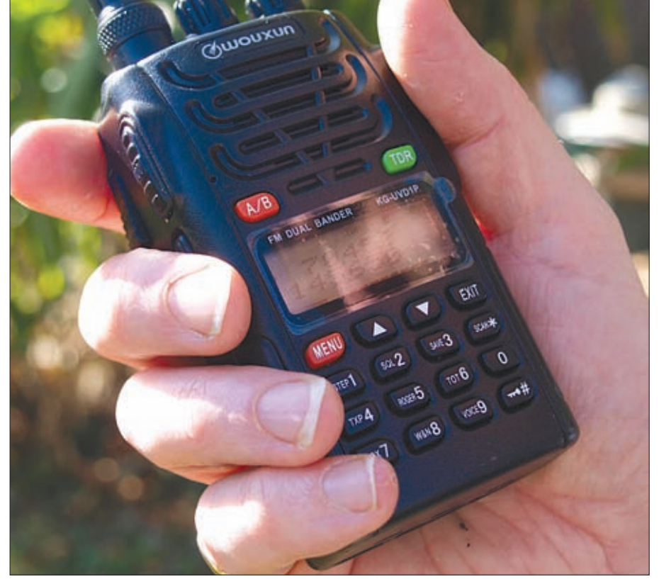
The dual band 70 and 144MHz fits nicely into Tim's hand.