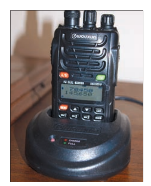
The transceiver on charge in its special cradle.

The rig has a voice operated transmitreceive switching (VOX) feature which could be quite useful. It was easy to configure it to trigger at different levels of voice. The rig also has a Band II broadcast radio built-in and I found this was quite sensitive and was able to receive a variety of local and national stations. This could be a nice feature. The rig would also be a useful scanner on the marine band around 156MHz, although once again, beware of transmitting as there is nothing to