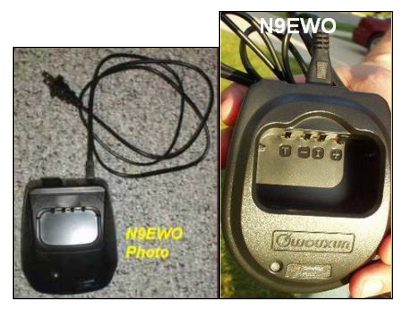
At least 3 different versions of the included "drop in charger" are floating around.

At power up the user can select to display the battery voltage for a few seconds (Menu # 12) just like the "Big Boy's" HT's.