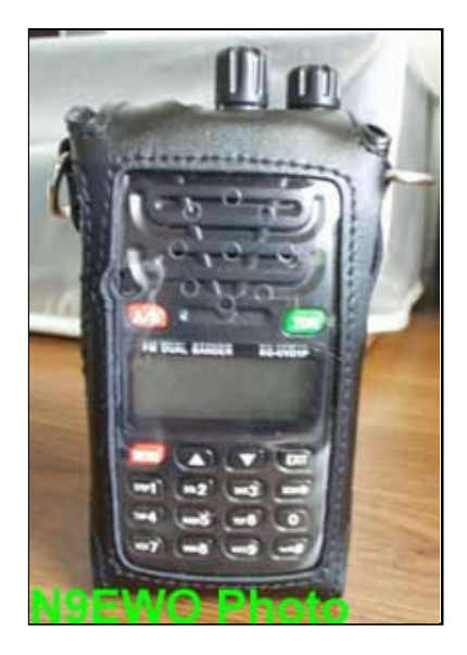
The Wouxun SC-23 Case. Full protection of the front panel keys Just remember to insert the radio from the top. You must remove the antenna every time.