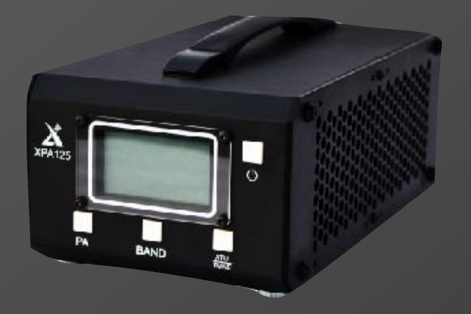
XPA125 125 watt HF/50 MHz power amplifier with automatic antenna tuner