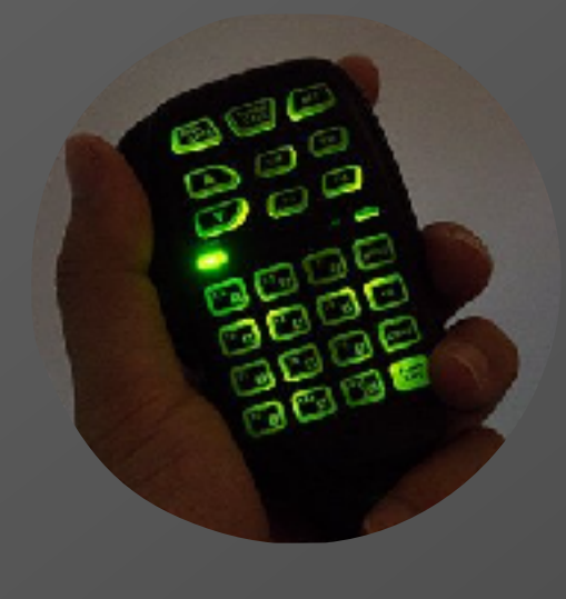
Standard hand mic with back light

X5105 HF/50MHz QRP Transceiver Hand microphone with keypad USB cable for FW updates and CAT Power supply cable English user manual Service card