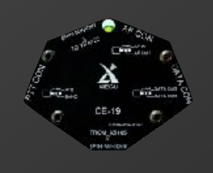
CE-19 Expansion port