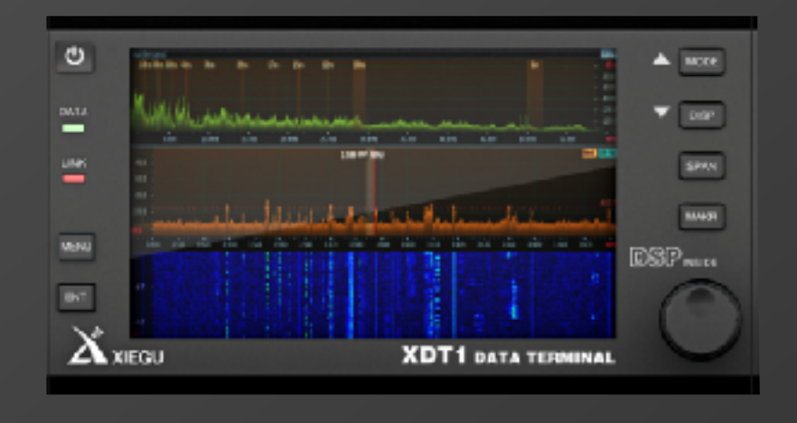
XDT1 Panadapter with spectrum and waterfall (available fall 2018)