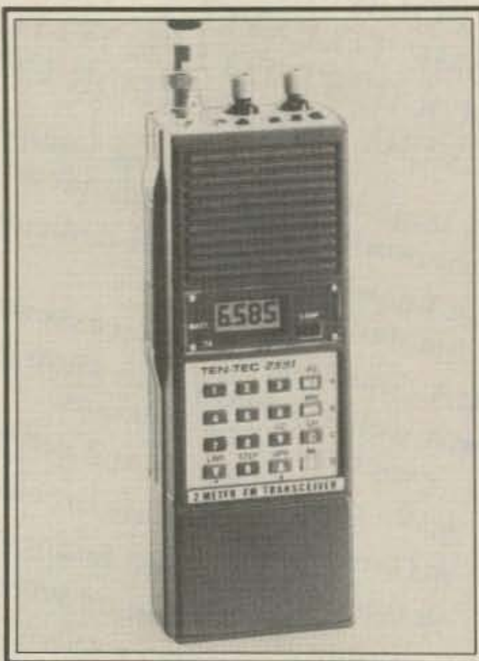
The Ten-Tec 2591 2 meter talkie is lightweight, powerful, and loaded with special features.

There are top-panel switches for transmitter offset, scanner hold or skip (carrier-operated or time-actuated squelch), keyboard lock,