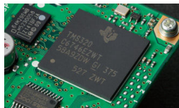
32-bit High Speed Floating Point DSP

The 32 bit high speed floating Point DSP (max 3000 MIPS) provides effective cancellation/reduction (DNR) of the random noise that is frequently frustrating in the HF frequencies. Also: the AUTO NOTCH (DNF) automatically eliminates the dominant beat tone. The CONTOUR, and the APF, are very effective receiver noise reduction tools in the HF bands operations. The YAESU original DSP QRM and noise reduction functions are provided.