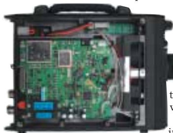
Under the top cover of the FT-897.

My thanks to Yaesu UK for the loan of the review items. ♦