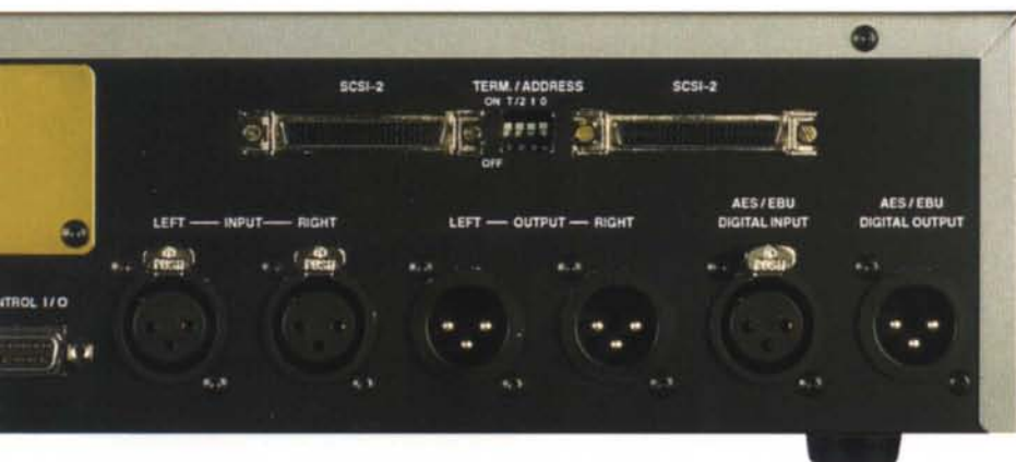
The Professional CD Recorder STUDER D741 is manufactured in Switzerland.