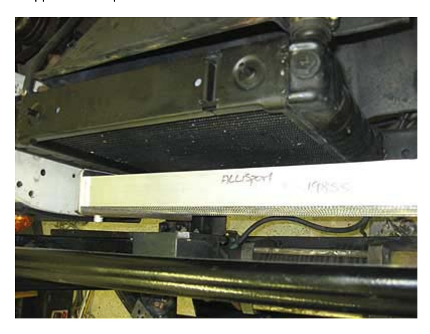
As you can see it will be a tight fit in front of the radiator and there is not much space left for the front panel and plastic grille.

After removing the old unit you can start fitting the new one. The instructions supplied are basic but clear enough. You will have to cut off the bottom edge of the front panel, the little edge which fold inwards to the radiator. These do also hold the two plastic nut for the radiator grille. The new intercooler has some small brackets which do fit to the chassis supports previously used by the two supporting bars. You can use these and refit the two rubber bushes from the old intercooler. Better is to replace the bushes anyway (part number 572312). The intercooler can now be dropped into it's place.