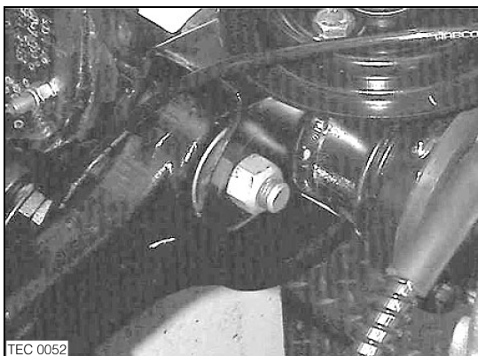
Illustration shows radius arm bracket without welded washers