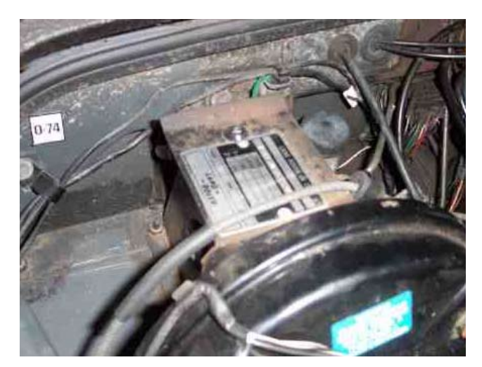
Chassis plate on Defender

From the end of 1979 Land Rover went over to the modern 17 digit VIN numbers - these are slightly harder to decode, but still no problem with the list below. Prior to this, 9 digit numbers, or 8 digits plus a suffix letter, were used.