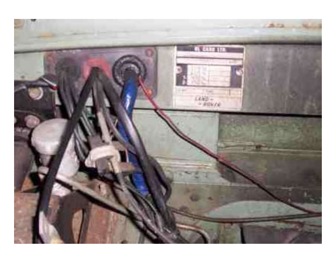
Chassis plate on later Series III (bonnet removed)