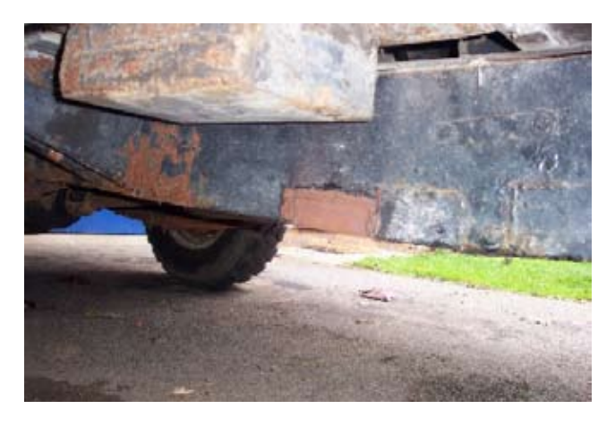
This patchwork quilt is even worse than it looks. The bottom face of the chassis was so rotten I could poke my fingers through it. The vehicle actually looked quite smart from above...

The other crucial structural component is the bulkhead - the structure to which the windscreen, dashboard, steering column, doors, bonnet and front wings are bolted. This, like the chassis, is a safety-critical item, and guess what? It's made from mild steel, and it rusts. Replacing a bulkhead is almost as involved and expensive as chassis replacement.