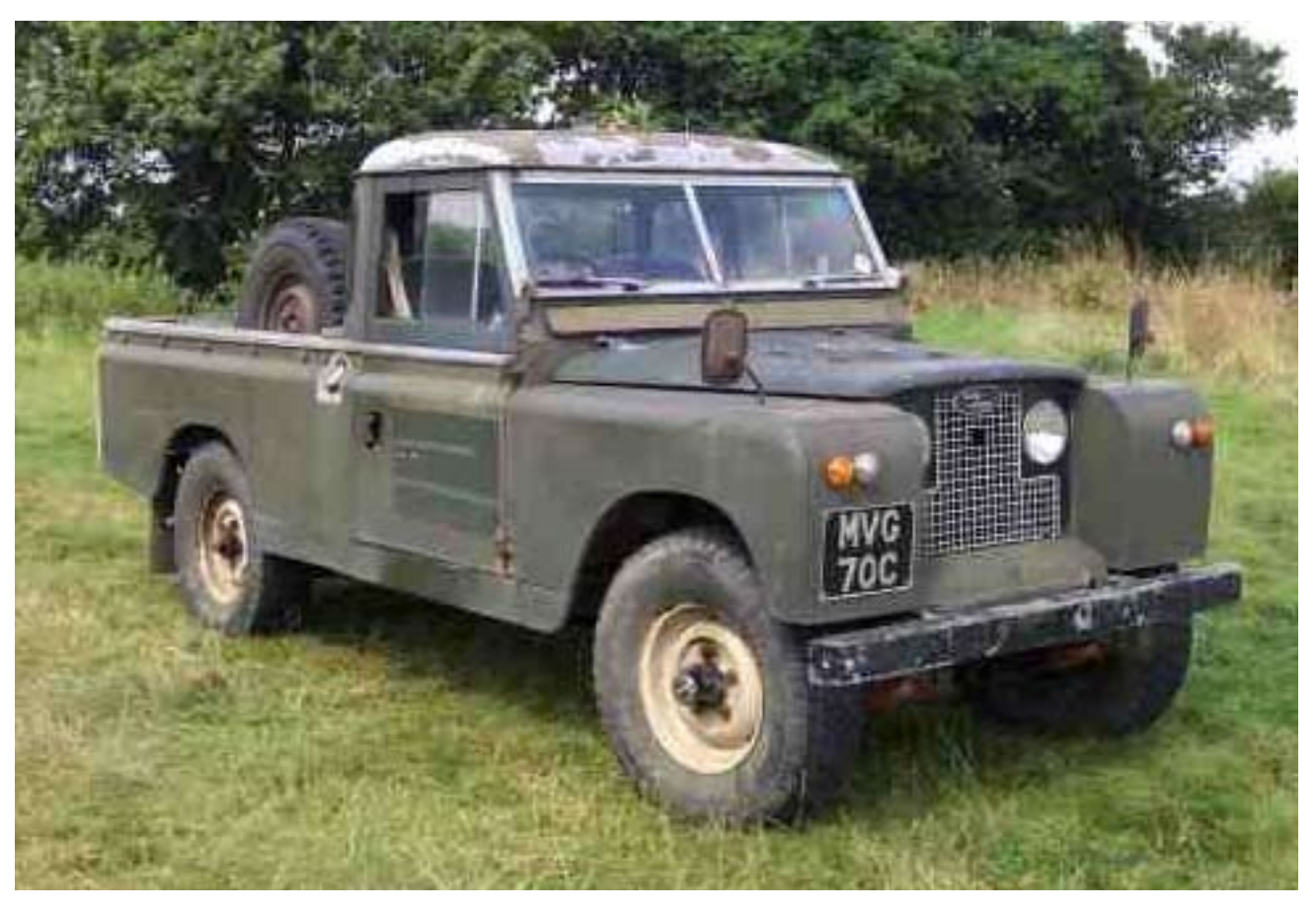
Series \ IIA \ in \ original \ unrestored \ condition. \ A \ forty \ year \ old \ vehicle \ still \ doing \ the \ job \ it \ was \ built \ to \ do. \ Lovely.

But don't forget the good points. These vehicles are simple, sturdy and easy to work on. Most parts are still available, and very cheaply at that. You can insure them on a classic car policy, there's no road tax to pay, and of course you have a genuine icon of British design, instantly recognisable the world over.