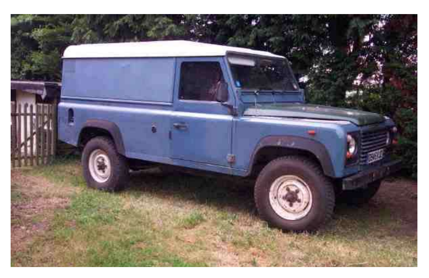
It's a Land Rover all right. But is it the right one for you?

There are many myths surrounding Land Rovers, so let's demolish a few of them at this stage.