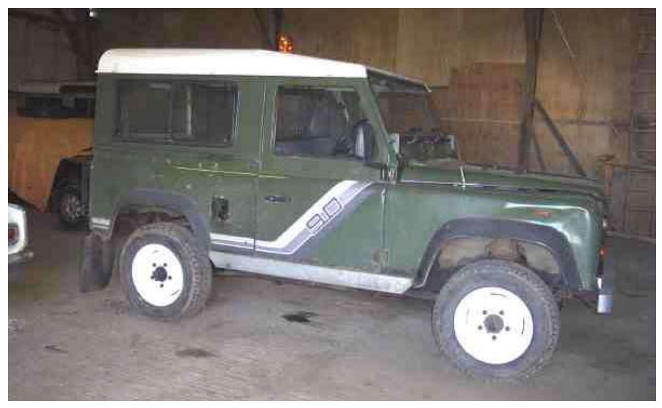
Typical example of a hard-working Ninety - actually my old workhorse, now gone to a new home.