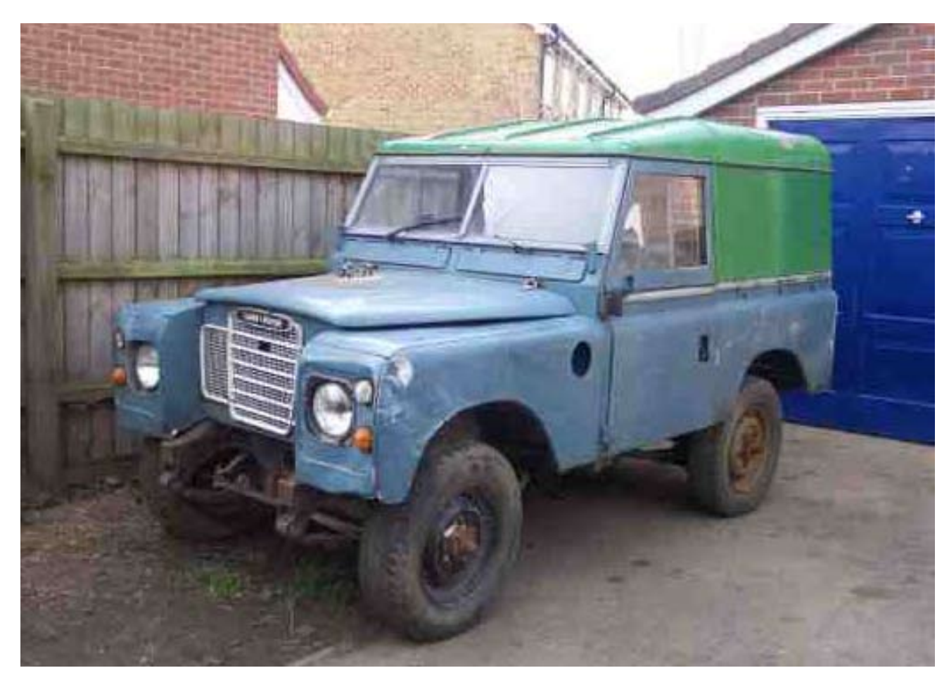
This Series III from 1981 has had a much harder life than the IIA pictured above. I sold this one for rebuilding.

*Sometimes you see pre-1990 vehicles described as Defenders. This is incorrect - the Defender model name did not appear until the new TDi engine was introduced in 1990.