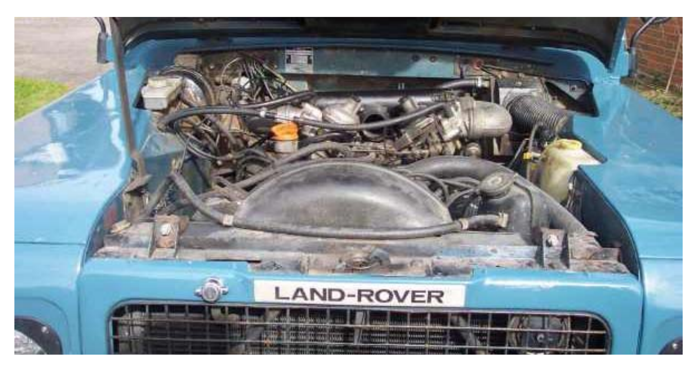
Prime suspect for climate change crime - the Rover V8 engine.

helping to offset the damage done through its poorer fuel consumption.