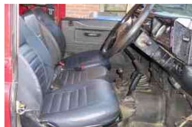
Compare and contrast - Series IIA on left, Ninety on right

II or III, if the chassis and bulkhead are sound (and they are pretty easy to inspect) then most other problems can be sorted out fairly cheaply. But turning a tired Ninety into reliable transport can become a very expensive game indeed. There are far more bad examples out there than good ones, and shiny paintwork is no guide to what lies underneath.