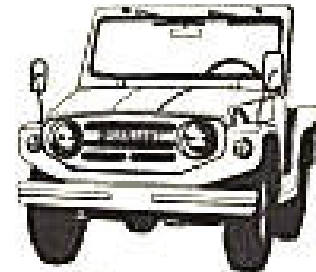
4-WHEEL DRIVE BRUTE IV