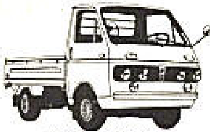
SUPER PICKUP L41 TRUCK