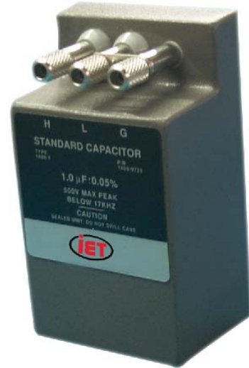
Model 1409 Standard Capacitance