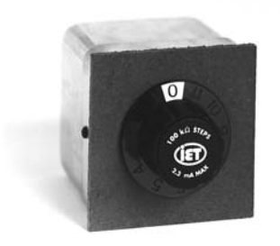
Single Decade HARS-X Unit

Each unit consists of low-inductance resistors in series, with a high-performance solid-silver-alloy-contact switch.