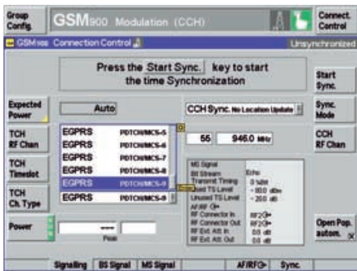
FIG 4 List of traffic channel types including GPRS and EGPRS channel coders

CMU300 is a universal RF tester for all aspects of base station tests. It features unmatched speed thanks to the use of Probe DSP™ technology, innova-