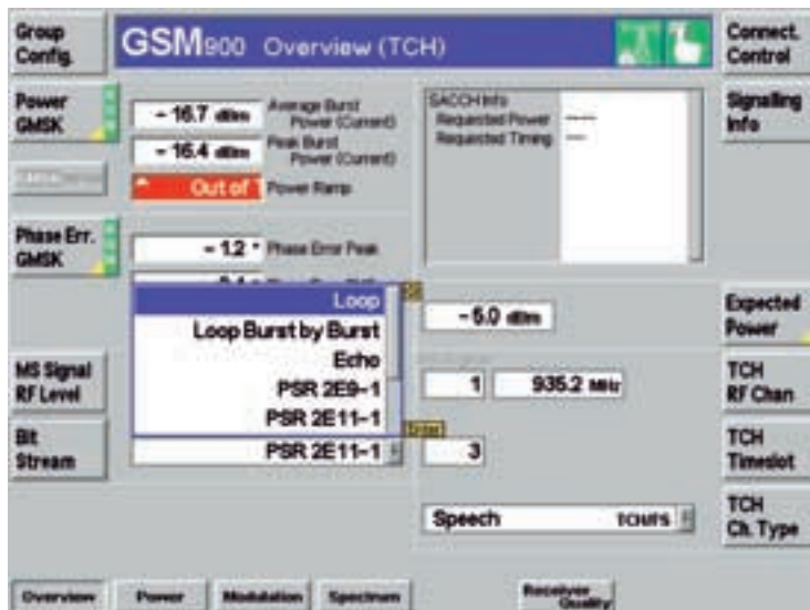
FIG 2 For bit-error-rate measurements, a bit sequence can be selected from a list, or CMU 300 itself can be used as an RF loop if the DUT sends the data stream