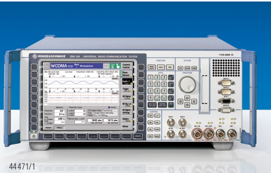
FIG 1 Measurement options with the R&S®CMU 200V10.

More information and data sheets at www.rohde-schwarz.com (search term: CMU 200)