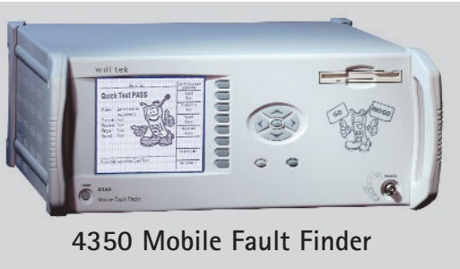
4350 Mobile Fault Finder